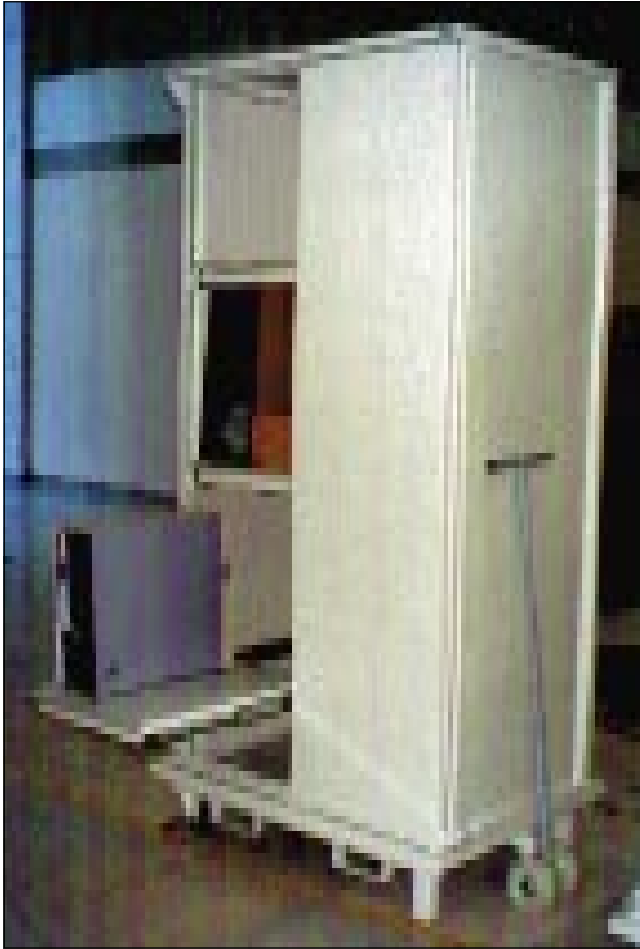
MGK Transit Containers: Secure goods storage & movement