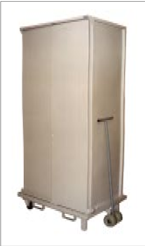
A clean, tidy piece of materials handling equipment.