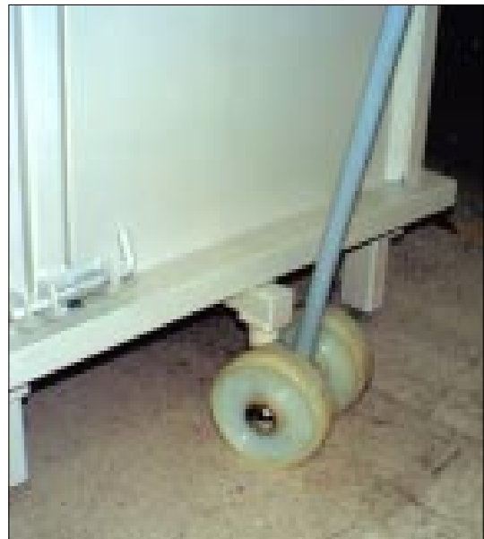
Semi-mobile: No need for a hand pallet truck

The angle supports can be adjusted to carry a variety of tote boxes which can incorporate foam inserts to protect components.