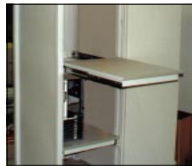
Adjustable pull-out shelves give 100% accessibility

Every company experiences growth and change, particularly in the electronics industry where new products are introduced with increasing regularity. MGK Transit Containers offer a range of storage solutions in a single system. When a product changes, or you need to move different materials or components, there is no need to look for another design. Using our adjustable internal angle system you can easily alter the layout of your transit container to accommodate the new material.