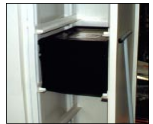
Adjustable support angles are ideal for tote boxes